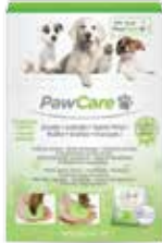
PawCare 6 Zip Bags x 100ml Item no. 46278