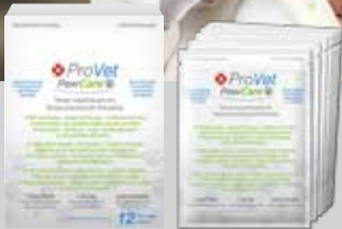
PawCare Pro Vet 12 Zip Bags x 50ml Item no. 46433