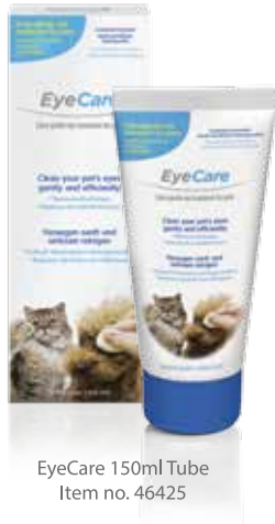
EyeCare 150ml Tube Item no. 46425