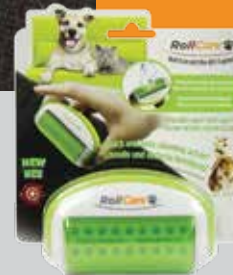
RollCare Travel Size Item no. 46445

Pets leave lint and hair everywhere on your clothes, around the house and in your car. RollCare products are clever household helpers with special functionality and ideal for households with pets. The washable and reusable lint roller quickly and efficiently cleans clothes, textiles and upholstery. The protective cap ensures easy storage and a long product life. RollCare is also available as practical and compact travel companion, fitting in every bag or luggage.