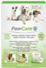
PawCare 3 Zip Bags x 100ml Item no. 46277